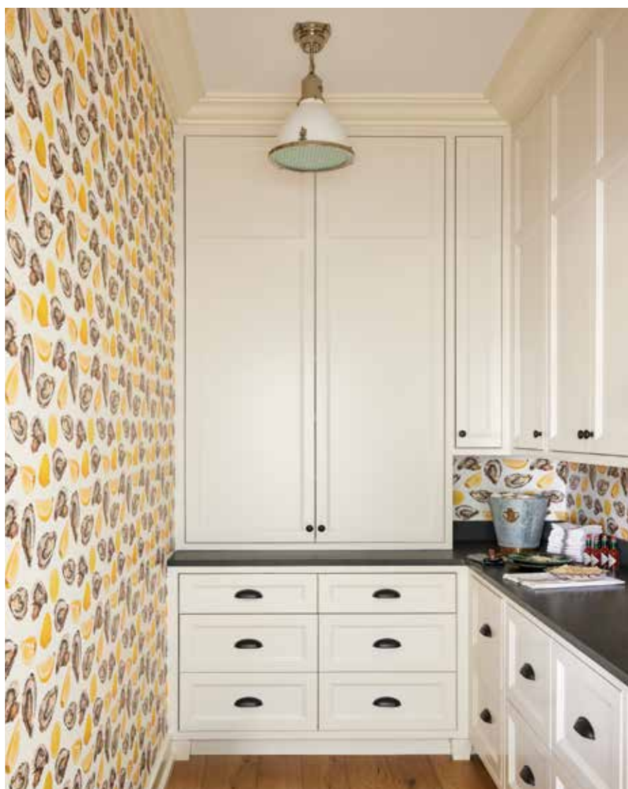
CLOCKWISE FROM TOP LEFT: Although the sisters' home is a touch less traditional in style, it complements the architecture of the parents' residence in an effort to create what feels like a cohesive compound. The clients didn't want a formal dining room, so Caan incorporated a banquette into the kitchen for casual meals; the barstools are from Hollywood at Home, and the pendants are from The Urban Electric Co. The pantry features a playful oyster print from Covered Wallpaper.

The design concept revolved around the idea of connecting the new house to the parents' home. "The parents' property has a pool and pool house that are now shared by both homes, so we used that to anchor a new outdoor space that serves as a nexus of activity," says Catalano. "It's an incredible site facing Nantucket Sound with southern exposure, so we took advantage of both and designed all rooms to face that way. The residence is similar in style to the parents' home, but it's not a recreation of what's