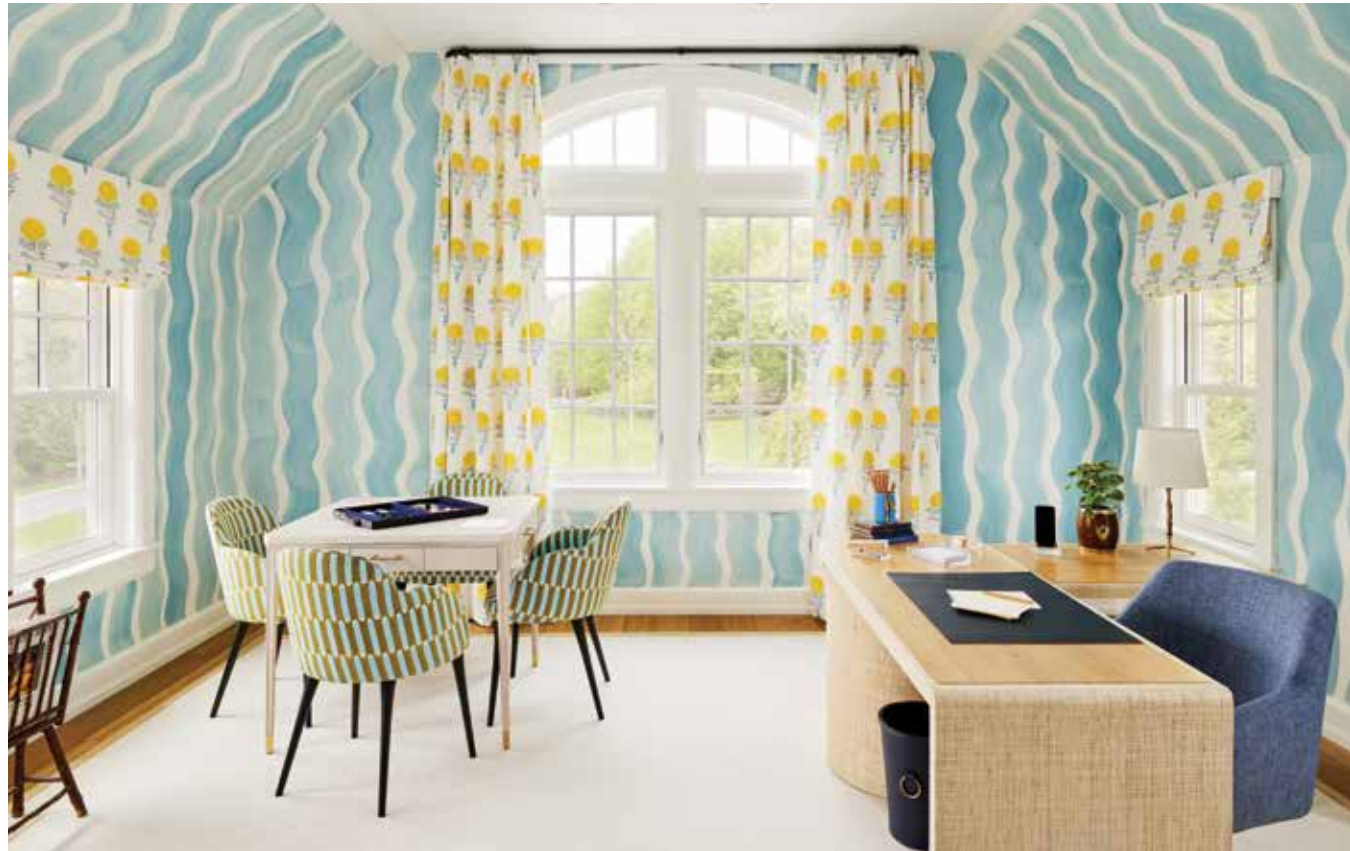
ABOVE: The office walls were hand-painted by Patina Designs, and both the window treatment fabric and the upholstery on the game table chairs are from Schumacher. BELOW: The bunk room, which contains four full beds and four twin beds, features a lobster-print ceiling paper from Root Cellar Designs.