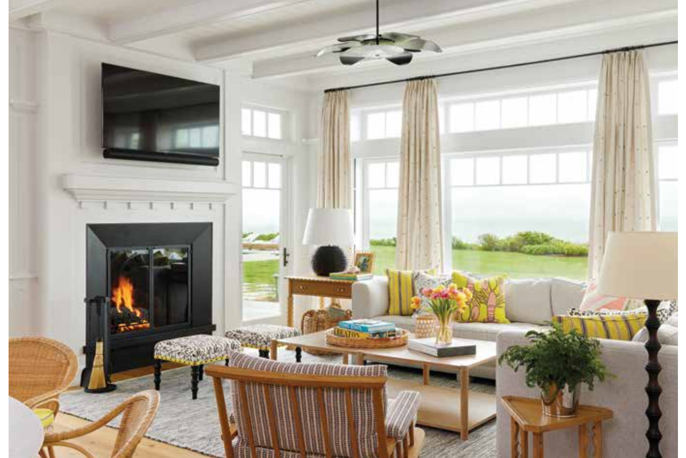
ABOVE: The kitchen sitting area, complete with a fireplace and a television, provides another space for the homeowners to entertain or hang out as a family. RIGHT: The third-floor landing leads to the bunk room and two additional guest rooms. FACING PAGE: The side entrance opens onto the mudroom, which is lined with vintage French pack and creel baskets.

ple staying here most weekends, whether it's one person or fifteen, so we needed as much sleeping space as possible. With the addition of the bunk room, six families can comfortably stay here.”