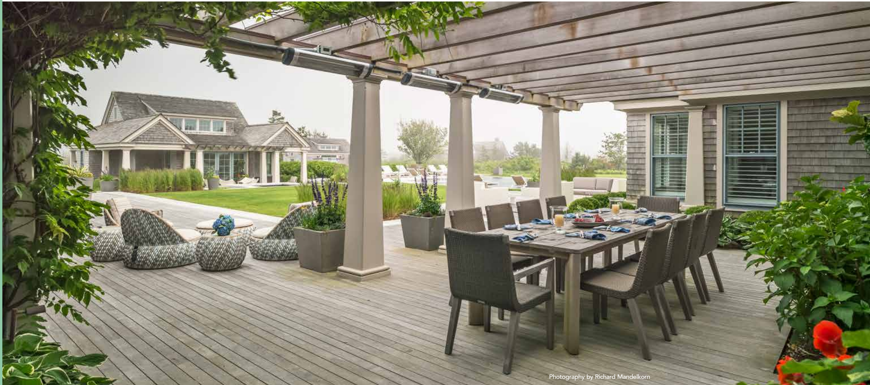
A grassy square where the pool was formerly located now harmoniously separates the main home from the guest house.